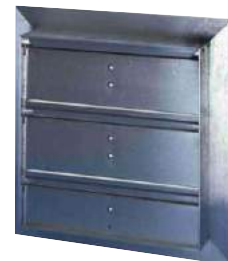
BACK DRAFT DAMPER

The Motorized dampers listed above are 110/230V. For 24V AC, replace X with Z.