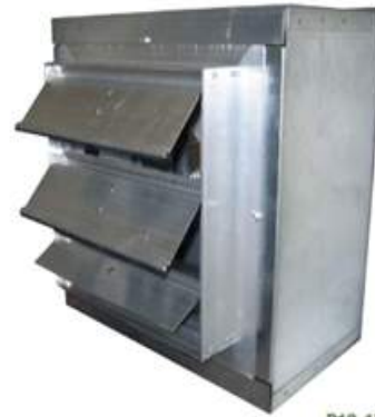
P12-1RS9M1115 FAN SHOWN COMPLETE WITH SLEEVE AND MOTORIZED DAMPER.