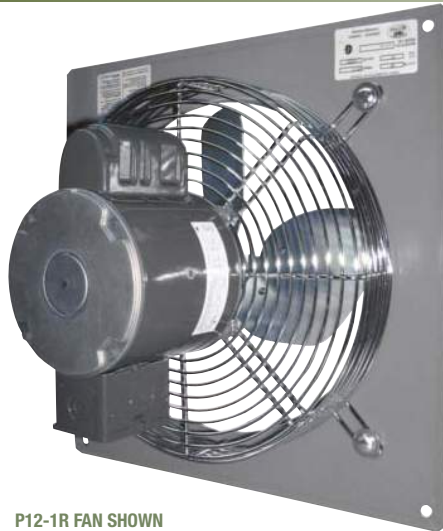
P12-1R FAN SHOWN