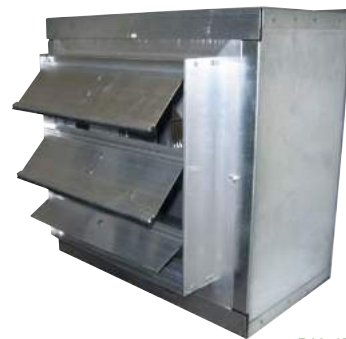
P12-1RS9M1115 FAN SHOWN COMPLETE WITH SLEEVE AND MOTORIZED DAMPER.

Designed for Industrial & Commercial Supply applications.